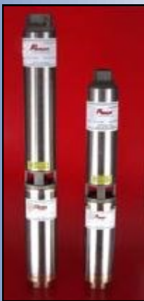
Submersible Pump 20 Liters per minute